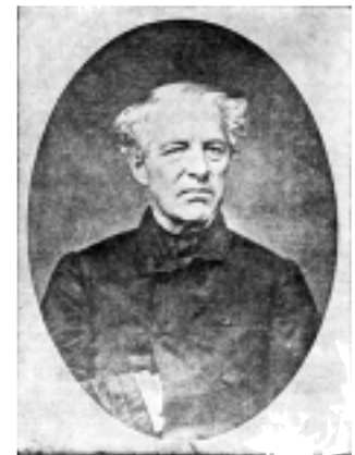
General Samuel Cooper June 12, 1798 December 3, 1876

Although General Cooper's contributions to history are everlasting, he is one of the least recognized and written about generals that served the South. Adjutant and Inspector General Samuel Cooper served both the United States of America and The Confederate States of America.