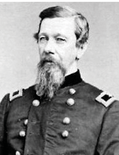
Brevet Brigadier General Alfred Sully

In the aftermath of the Dakota War of 1862, the U.S. government continued to punish the Sioux, including those