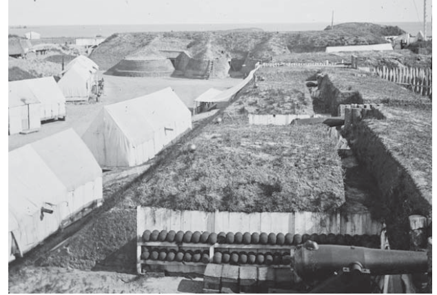
Interior View of Fort Wagner