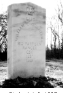
Birth: Jul. 3, 1837 Death: Jun. 6, 1865 Confererate Cemetery Higginsville, Missouri