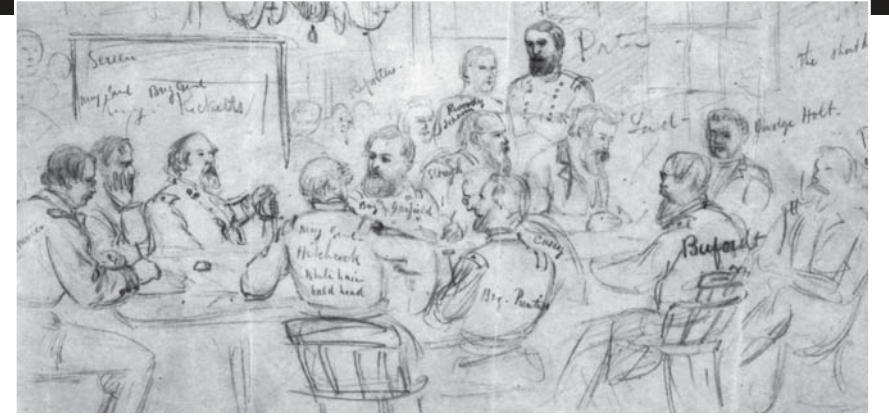
Court-martial of Brigadier General Fitz-John Porter