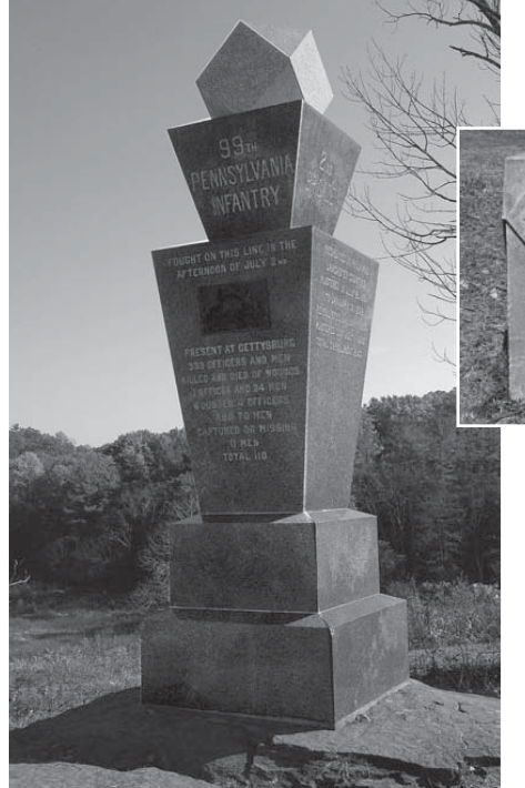
99th Pennsylvania Infantry regiment located at Devil's Den at Gettysburg

of the Blue Ridge, and then, on October 10th, it was put in motion