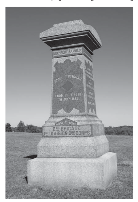
99th Pennsylvania Infantry regiment located on Hancock Avenue at Gettysburg

Regiment. Thus reinforced, with the brigade, the "99th" crossed the James River and was merged in the host of besiegers around Petersburg. Late in July the Second Corps was sent to check a Confederate movement at Deep Bottom, a second tour to this troublesome point being necessary in August. Thereafter the fighting was all south of the James River. In the two weeks preceding the surrender of the