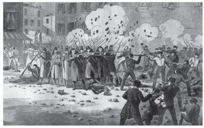
The Battle in Baltimore - Harper's Weekly

"Philadelphia in the Civil War" Published in 1913