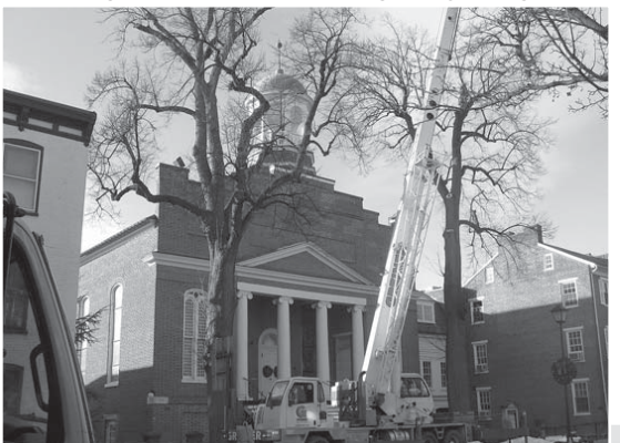
January 5, 2010 Photo: Gettysburg Daily

January 5, 2010 - Photo: Gettysburg Daily