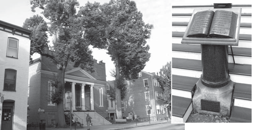
Summer 2009 - Photo: Lisa Shower

They watched classes from the United States Military Academy including the Class of 1915 (The Class the Stars Fell On) posing beneath them on the church steps. They saw the Church used doing World War I as a "canteen" for soldiers assigned to Camp Colt. They saw the "boom times" of the Roaring Twenties, the 1950s and the 1980s. They saw hard economic times at different periods during the 19th century, the Great Depression of the 1930s, and today. They saw soldiers leave for World War II, Korea, Vietnam, the Iraq Wars, and Afghanistan.