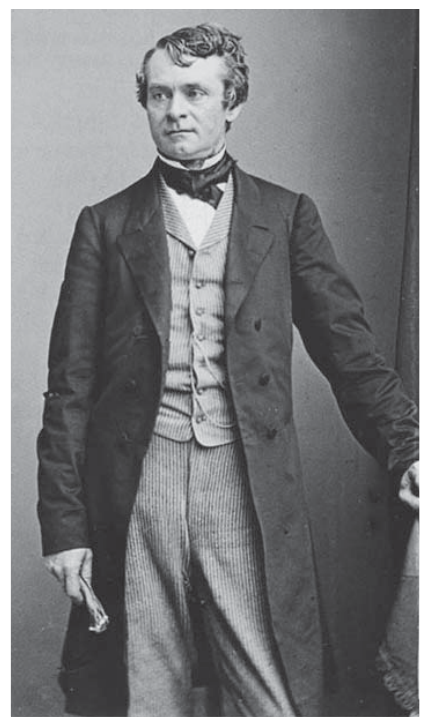
Governor Andrew Curtin Continued on page 7

The Supreme Court's decision overturned several election results in Pennsylvania, giving some offices to Democrats and