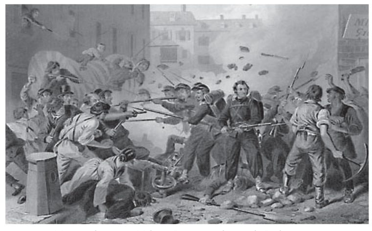
Massachusetts Militia Passing through Baltimore.

the rebellion, but those destined for Washington had to first pass through Baltimore. On April 18, a Pennsylvania regiment was hooted and pelted with rocks as it marched from one train station to another. The next day two more regiments arrived. Four companies of the 6th Massachusetts Volunteer Militia were set upon by a mob on Pratt Street and opened fire, killing a dozen civilians before reaching the safety of Camden Station.