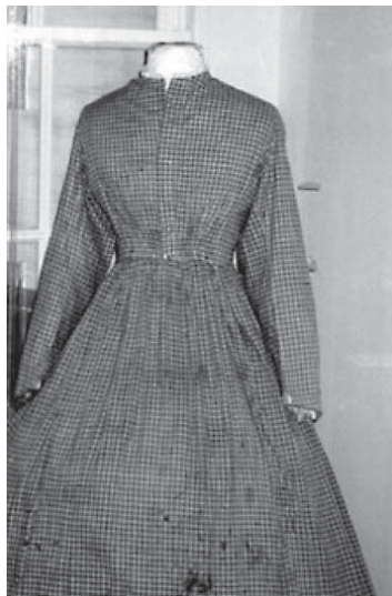
Dress worn by a Civil War nurse (National Museum of Civil War Medicine, Frederick, MD.)