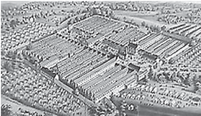
Satterlee Hospital, West Philadelphia

In the late spring of 1862 the U.S. Military Hospital known as Satterlee was founded in West Philadelphia, near the ferry landings on the Schuylkill River at the base of 42nd Street. There the sad results of war—desperately wounded and sick soldiers—were being landed in droves and transported through the quiet streets of that neighborhood to the Hospital. Thus the terrible consequences of war were brought home.