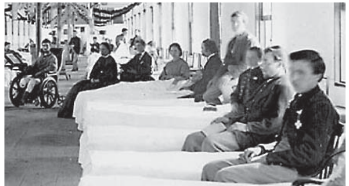
"Ward in the Carver General Hospital, Washington, D.C."

supplies. She returned to Philadelphia briefly in April 1863 to spend some time with her family and restock supplies; then she left for Northern Virginia just before the Battle of Chancellorsville.