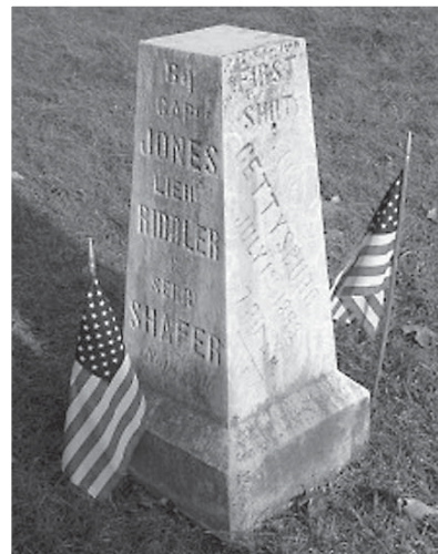
First Shot marker west of Gettysburg