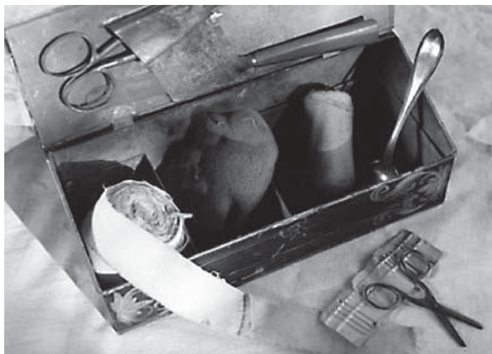
Civil War nurse's field kit

and was there with General Meade's army during the Mine Run campaign. She continued to offer her nursing services as before, but now she was dealing with the wounded as