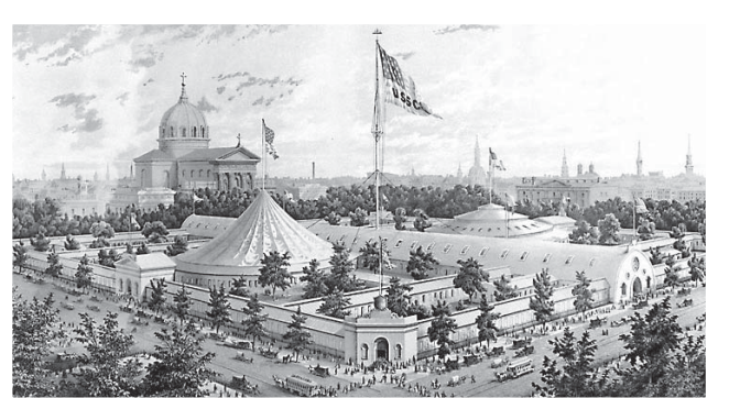
Philadelphia Sanitary Fair

The USCC was founded in the summer of 1861 when observers' reports and soldiers' uncensored letters to friends and family disclosed that many, if not most, federal recruits were subjected to decidedly unsanitary living conditions. While the mechanisms of infection were not understood in this pre-germ theory era, it became evident that a correlation existed between outbreaks of epidemic illness in the camps and the degree of filth and poor diets. As a flood of state-organized volunteer regiments swamped the administrative capacities of the Federal army, it also became evident that the U.S. government was poorly prepared to