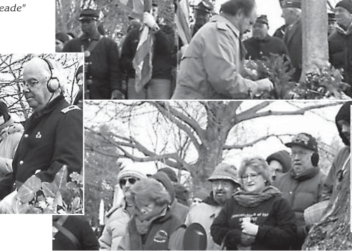
Continued from page 5 - "Meade"