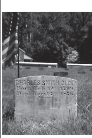
Governor Charles Smith Olden