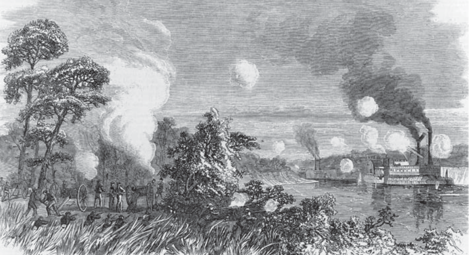
Confederate shore batteries shelling Union Gunboats

Other historians have claimed that the campaign was also motivated by concern regarding the 25,000 French troops in Mexico sent by Napoleon III and under the command of Emperor Maximillian. At the time, the Confederates offered to recognize the government of Maximillian in return for French recognition of the Confederacy; the Confederates also hoped to gain access to valuable war goods through this recognition. However, Banks's campaign on the Texas coast during November and December 1863 had satisfied President Abraham Lincoln, who wrote to Banks: "My thanks for your successful and valuable operations in Texas."